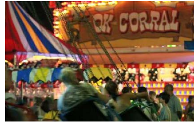
Bullitt County, Ky., Fair draws record crowds