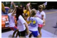
2012 Tap 'N' Run 4K Beer Race