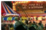
Bullitt County, Ky., Fair draws record crowds