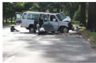
Van accident sends 15 kids and 2 adults to hos...