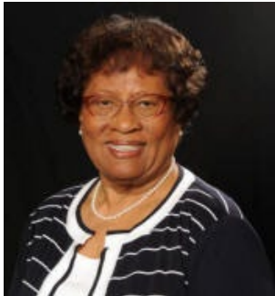
Past Surgeon General Joycelyn Elders, MD