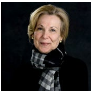
Ambassador Deborah Birx, MD "COVID-19 USA - Lessons and new tools to improve workplace safety". Past White House Coordinator Coronavirus Response (USA) View Video