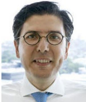
Ziyad Al-Aly, MD "An Overview of Long COVID" (USA) View Video