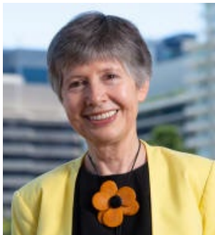
Professor Lidia Morawska, PhD, MSc. "Airborne infection transmission & Impact on Frontline Workers" Time Mag. Top 100 Most influential persons in the World for 2021. (Australia) View Video