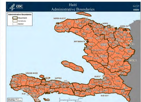
Cholera & Haiti