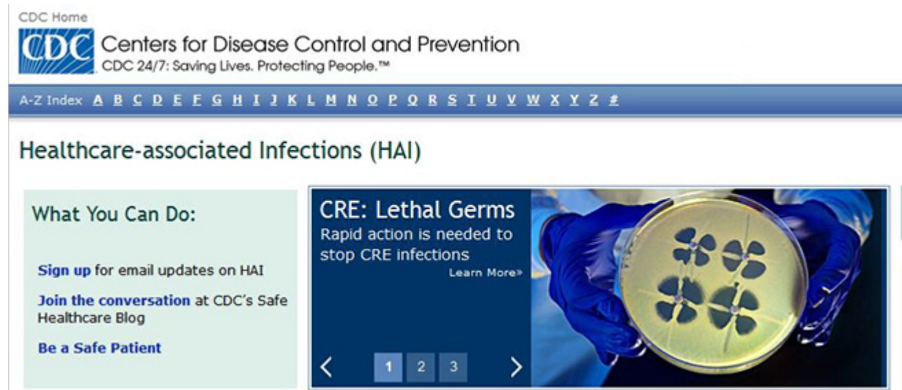
Above: Picture of CDC HAI web page. Click on Picture to go to the CDC Page

http://www.jstor.org/stable/10.1086/670217